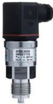
Figure 4. A pressure transmitter used in irrigation systems (Anonymous, 2023b)

Pressure transmitters reliably convert small pressure changes into electrical signals as well as large pressure changes. They usually produce a 4-20 mA output signal. They react to pressure changes in pressurized lines within a few milliseconds (Anonymous, 2023b). An image of a pressure transmitter used in irrigation systems is given in Figure 4.