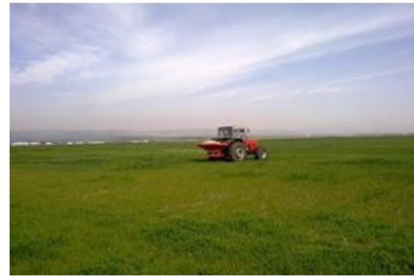
Figure 8. Fertilizer application studies in wheat production

In a recently developed fertigation system, a 25 W solenoid-based dosing pump was used to pump liquid fertilizer into the water inlet pipe of hose reel irrigation machines. There is a monocrystalline photovoltaic panel with a maximum output power of 195 WP in the system in order to meet the electricity need of the dosing pump used independently from the grid. Liquid chemical fertilizers could be mixed with the components used in the system with a high homogeneity of 99% into the irrigation water ( Polat et al., 2022 ). Thus, it has been revealed that fertilization can be done by irrigation in enterprises using hose reel irrigation machine, without using solid granular fertilizer with tractor and fertilizer spreader. It has been explained that the fertigation application using a photovoltaic panel with a hose reel irrigation machine is a suitable technique for energy efficiency by eliminating the necessity of energy expenditure for fertilizer distribution ( Polat and Çolak, 2022 ). The images of the fertigation system components developed for hose reel irrigation machines are given in Figure 9.