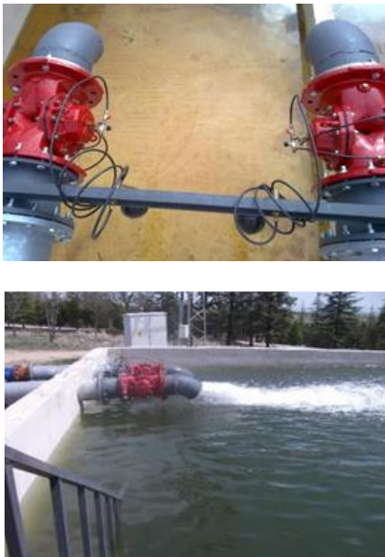
Figure 10. Float valves

Float valves are used to ensure that the water level in the pools used as reservoirs is not higher than the desired maximum level. The valve, which has an object that acts as a floater is installed at the water inlet of the buildings used as reservoirs. The floater ensures that the valve closes when the water level rises. Images of float valves used in a pool built for more than one hose reel irrigation machine are given in Figure 10.