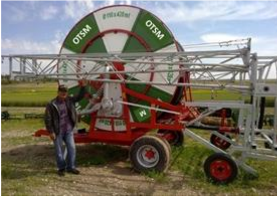
Figure 1. Hose reel irrigation machine with a boom