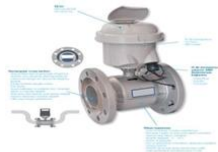
Figure 7. A water meter with a high technological level (Anonymous, 2023d)

Counters are used to measure the total amount of fluid passing through a line. A water meter is a measuring instrument designed to measure, store and display the volume of water coming from the measuring transducer under measuring conditions (Ciftci, 2008). Many types of meters have been developed for water measurement. By adding a GSM module to the recently developed meters, remote reading and high accuracy measurement can be made. Energy saving is achieved due to the low shape losses caused by these meters, which have a flat measuring tube that is resistant to wear and has no moving parts. In addition, the meters, which have a dustproof and submersible protection class (IP 68), can be used by mounting underground (Anonymous, 2023d). The image of a high-tech water meter that can be used to measure the amount of instant and total water consumed is given in Figure 7.