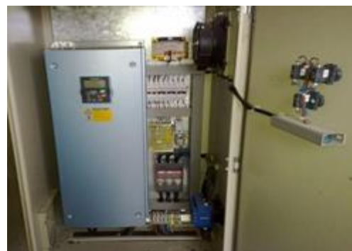
Figure 3. Frequency converter used in series connected pumps

Energy saving is achieved by adjusting the motor speed according to the need. About 20% of the total energy produced in the world is consumed in pumping systems, especially centrifugal pumps (Shankar et al., 2016). Therefore, efforts to save energy in enterprises using centrifugal pumps are very important in terms of both unit product cost and environment. Using a frequency converter with water pumps reduces energy consumption by about 15-20% (Yimchoy and Supatti, 2021). The image of the frequency converter used to feed a submersible pump and an inline pump by operating at different speeds is given in Figure 3.