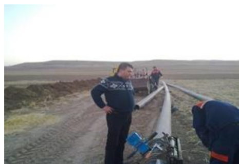
Figure 6. PE 100 pipes and jointing works by butt welding method