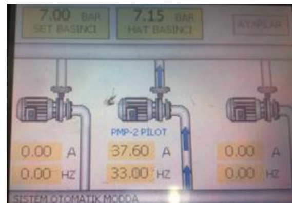
Figure 5. PLC used in an irrigation pumping plant