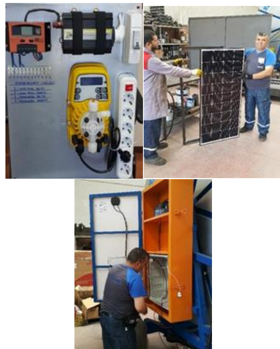
Figure 9. Images of the fertigation system developed for HRIM

In a recently developed fertigation system, a 25 W solenoid-based dosing pump was used to pump liquid fertilizer into the water inlet pipe of hose reel irrigation machines. There is a monocrystalline photovoltaic panel with a maximum output power of 195 WP in the system in order to meet the electricity need of the dosing pump used independently from the grid. Liquid chemical fertilizers could be mixed with the components used in the system with a high homogeneity of 99% into the irrigation water ( Polat et al., 2022 ). Thus, it has been revealed that fertilization can be done by irrigation in enterprises using hose reel irrigation machine, without using solid granular fertilizer with tractor and fertilizer spreader. It has been explained that the fertigation application using a photovoltaic panel with a hose reel irrigation machine is a suitable technique for energy efficiency by eliminating the necessity of energy expenditure for fertilizer distribution ( Polat and Çolak, 2022 ). The images of the fertigation system components developed for hose reel irrigation machines are given in Figure 9.